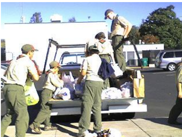
Scouts busy counting and loading food for delivery to Alameda County Food Bank