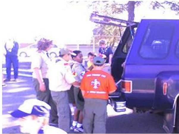
Cub Scouts from Pack 726 with T726's Scouts unloading food