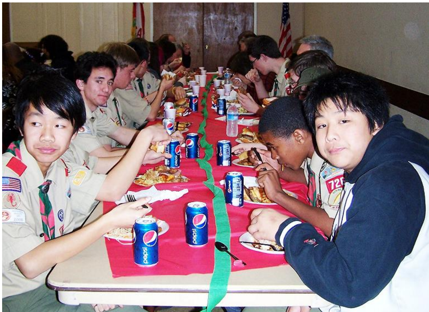
Red and Green Dinner, Feb 10, 2010 at Masonic Center