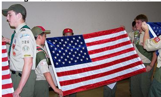
Court of Honor, Dec 9, 2009 Flag Presentation to 1 st Class Scouts